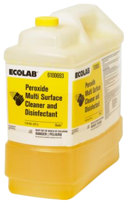
Peroxide Multi Surface Cleaner and Disinfectant